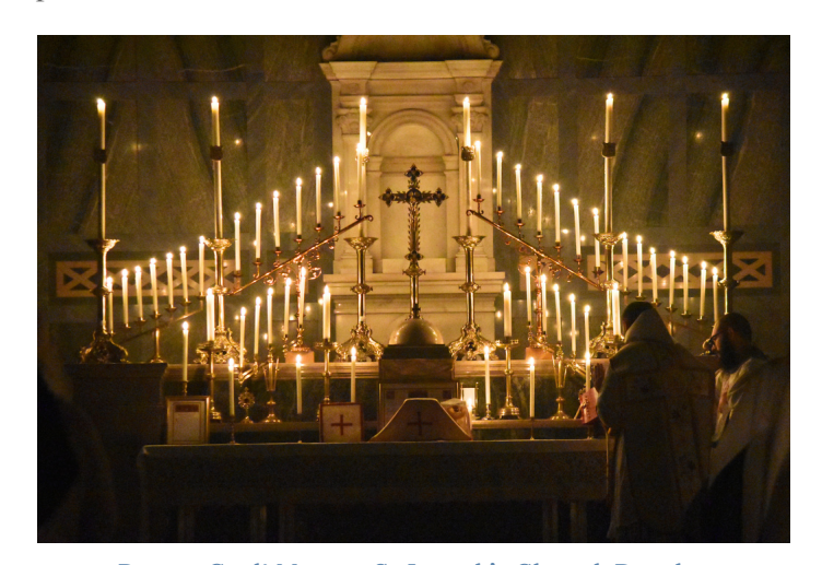
Rorate Caeli Mass at St Joseph's Chapel, Dundee

In Dundee, the friars' apostolate includes pastoral support to the Scottish faithful, as well as a novitiate for friars in formation and a studium for the training of future friar priests.