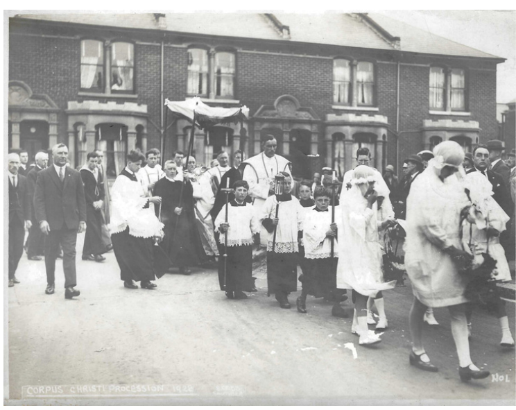
St. Joseph's, Portsmouth: Corpus Christi Procession c. 1928

Currently the Friends of the Marian Franciscans charity (FMF) supports the friars in two locations: Portsmouth and Dundee.