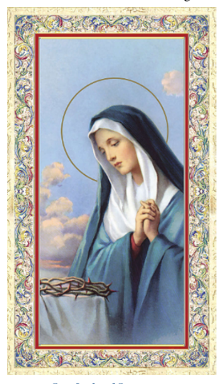
Our Lady of Sorrows, Holy Card