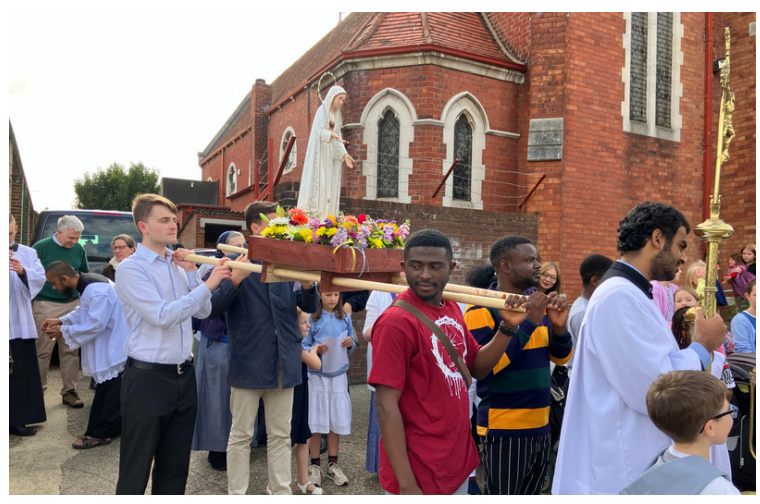
Marian Procession, Portsmouth 2023