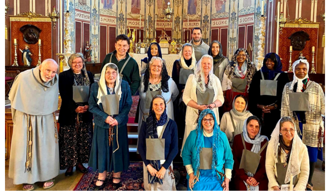
The Newly Invested Marian Franciscan Third Order Novices, May 25, 2024

Satan loves to obstruct spiritual warriors as much as he can and difficulties arose regarding the venue and time for the investiture of the sixteen as novices. Eventually it was worked out that the investiture process would be split in two.